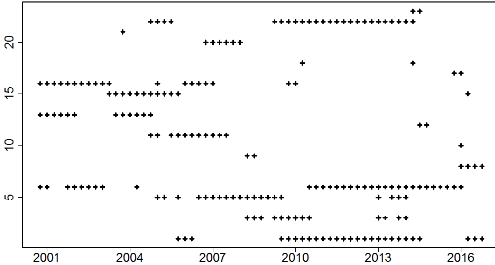
Figure 2: Selected Forecasters

Notes: The x-axis denotes time, and the y-axis denotes forecaster ranking, where a smaller y-axis location refers to a forecaster with smaller overall RMSE. A “+” symbol at location (x, y) indicates that forecaster y was selected at time x .